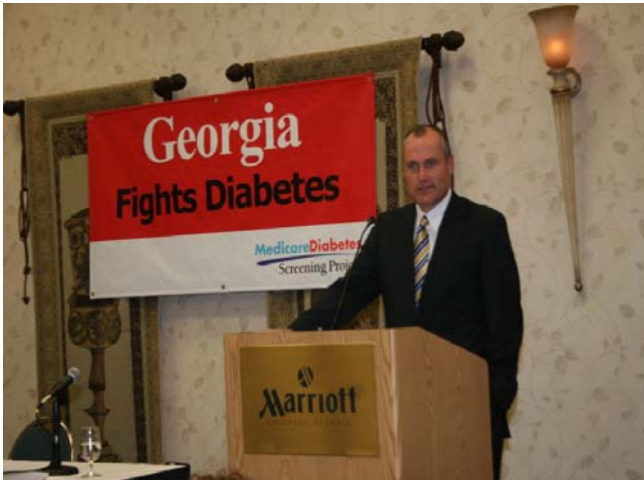
Lt. Gov. Casey Cagle Addresses the MDSP Georgia Summit in Columbus on November 6, 2008